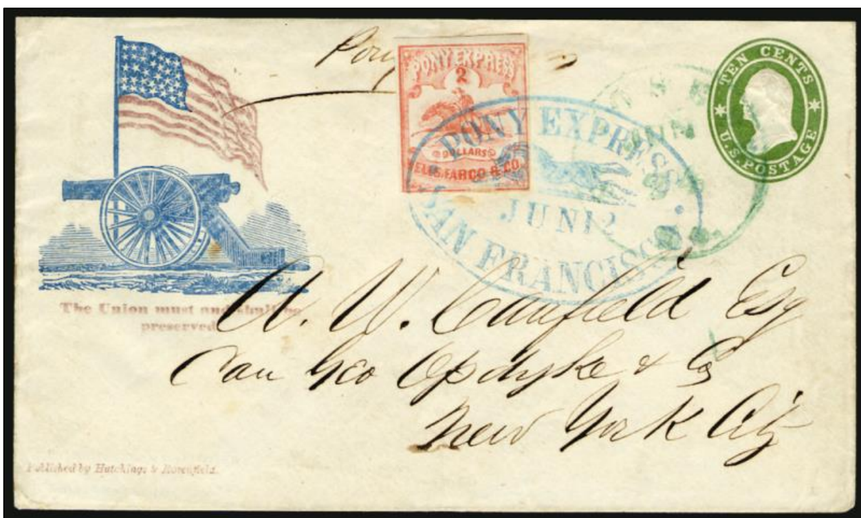
Pony Express Patriotic Cover.

The Smithsonian National Postal Museum celebrated its 25th Anniversary back in July, but we are celebrating all-year-round our silver anniversary! With more than 6 million objects in our collection, the Museum is able to tell unique stories from America's history. We asked members of our community, including staff, visitors, council members, volunteers and donors, to share what their favorite object from our collection and their responses varied from as small as a postage stamp to as large as a bus! Each person chose an object that captures America's compelling stories and collectively reflect the diversity of the Museum's collection. Did your favorite make the list?