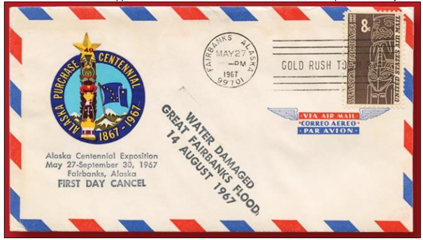
A comparison of the date of cancellation and the date of the handstamp on this 1967 Fairbanks, Alaska, cover reveals that the "water damaged, great Fairbanks flood" marking was added more than two months later.

When a cover is delayed or damaged in the mail it is often handstamped to indicate what caused the problem. That's what I assumed had happened when I first saw the Fairbanks, Alaska, cover pictured nearby.