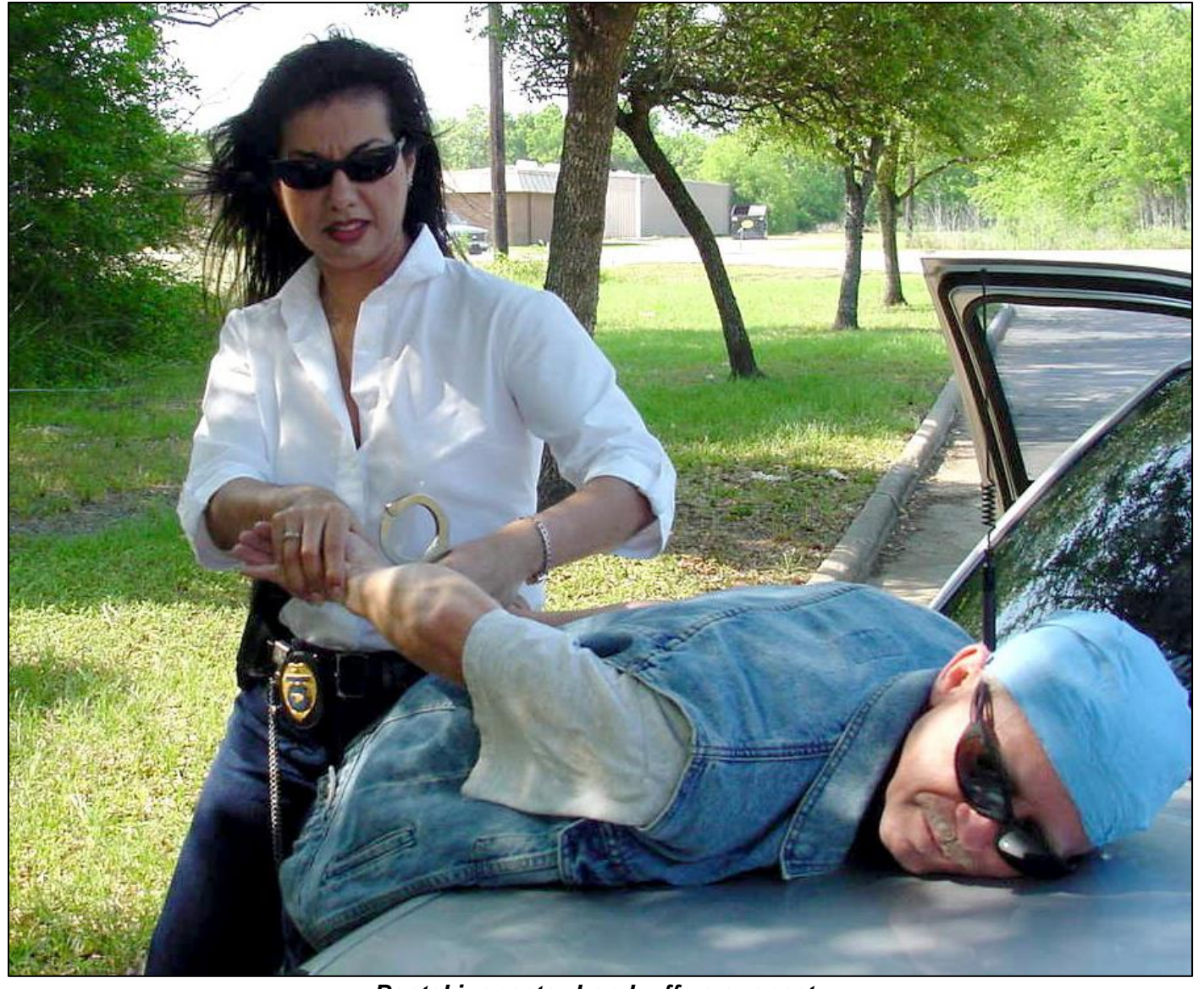
Postal inspector handcuffs a suspect.

The vast postal network makes it easy to share goods and services. But easy access also makes the postal system a target for abuse. The Postal Inspection Service investigates and responds to criminal activity that involves the U.S. Postal Service and U.S. mail.