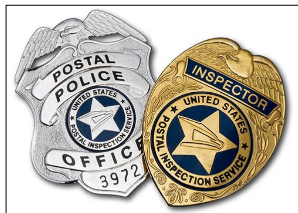
Postal Police Officer and Postal Inspector badges