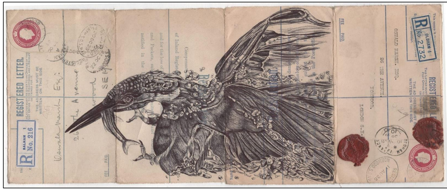
Artist Mark Powell uses an ordinary ballpoint pen to draw onto alternative surfaces such as old documents, underground maps, and antique letters.