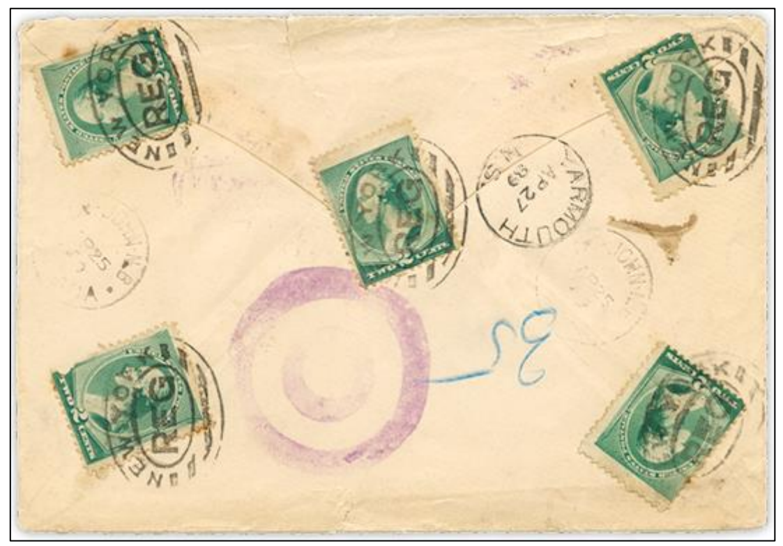
Figure 2. The reverse side of the cover in Figure 1 reveals that five 2¢ green Washington stamps of the 1887 issue paid the 10¢ registration fee.

These days the black flap is simply canceled so that opening the envelope and resealing it without care will show a mismatch between the parts of the cancel on the flap and those on the rest of the envelope. On the whole, I like Gremmel's method better. Of course, now it also is a requirement that stamps be placed on the front of the envelope.