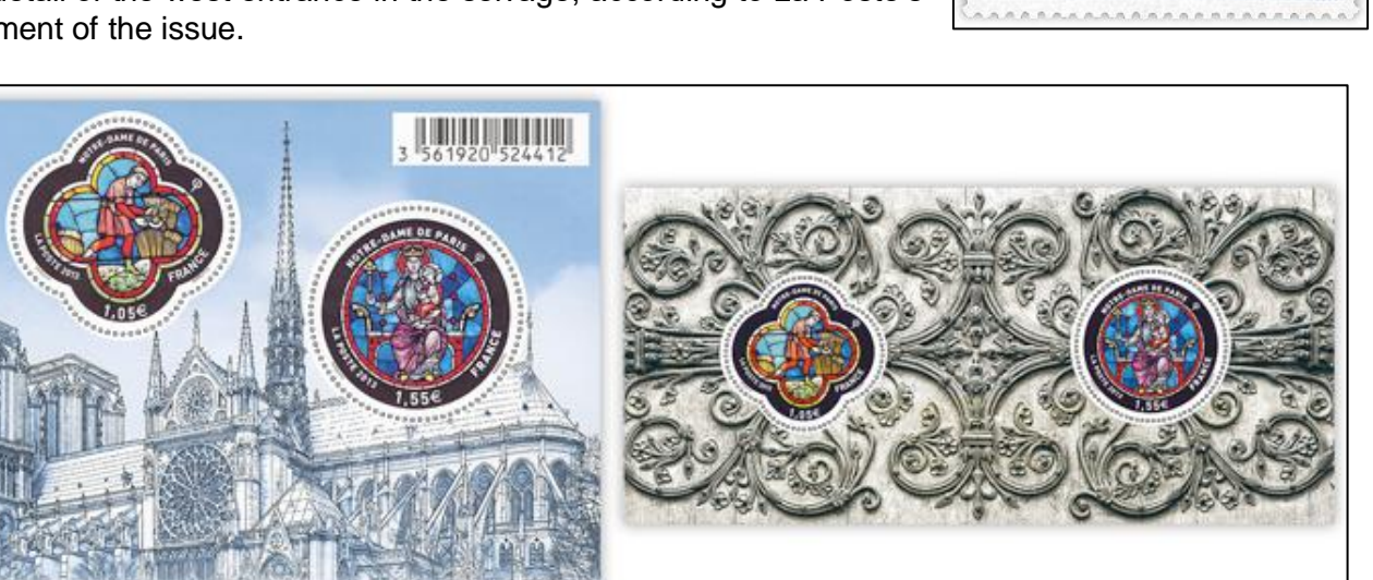
Figure 3. Two souvenir sheets celebrating the 850th anniversary of the cathedral was issued in 2013. They contain the same two commemorative stamps but have different selvage designs.

850° ANNIVERSAIRE DE LA CATHÉDRALE NOTRE-DAME DE PARIS