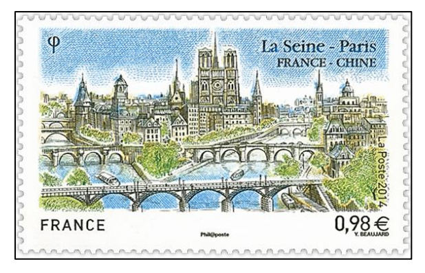
Figure 4. Notre Dame Cathedral dominates the background of the Seine River scene on this 2014 stamp.

Rather than specifically commemorating the cathedral, some French stamps include it as part of a Parisian scene. For instance, the 0.98 stamp in Figure 4 features the Seine River with the cathedral shown prominently in the background. Part of a joint issue with China, the stamp (Scott 4588) was released March 27, 2014.