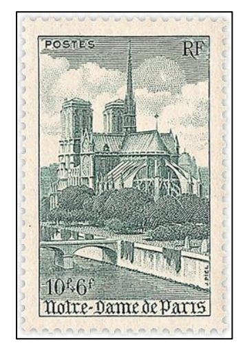
Figure 1. A 1947 French semipostal pictures Notre Dame Cathedral.

The more than 850-year-old cathedral has been pictured many times on the stamps of France. Figure 1 shows one of the most beautiful, the 10-franc+6-franc semipostal issued in 1947 (Scott B217).