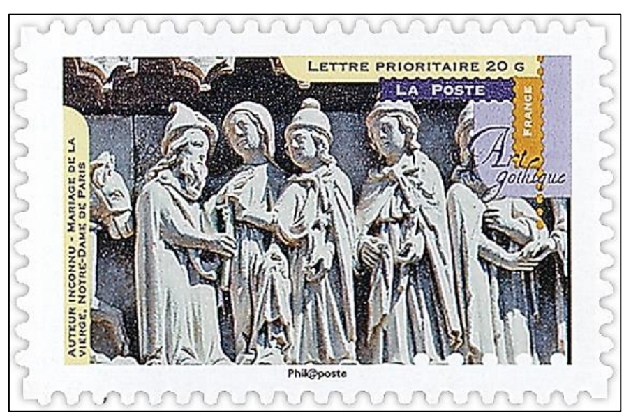
Figure 6. Notre Dame was represented on a stamp in a 2013 booklet focusing on Gothic art.

A stamp in a 2013 booklet dedicated to the theme of Gothic art (Scott 4460) depicts the frieze Marriage of the Virgin from the cathedral, shown in Figure 6. In addition, Notre Dame is represented on a stamp in the 2016 booklet that highlighted the art of stained glass windows (5148).