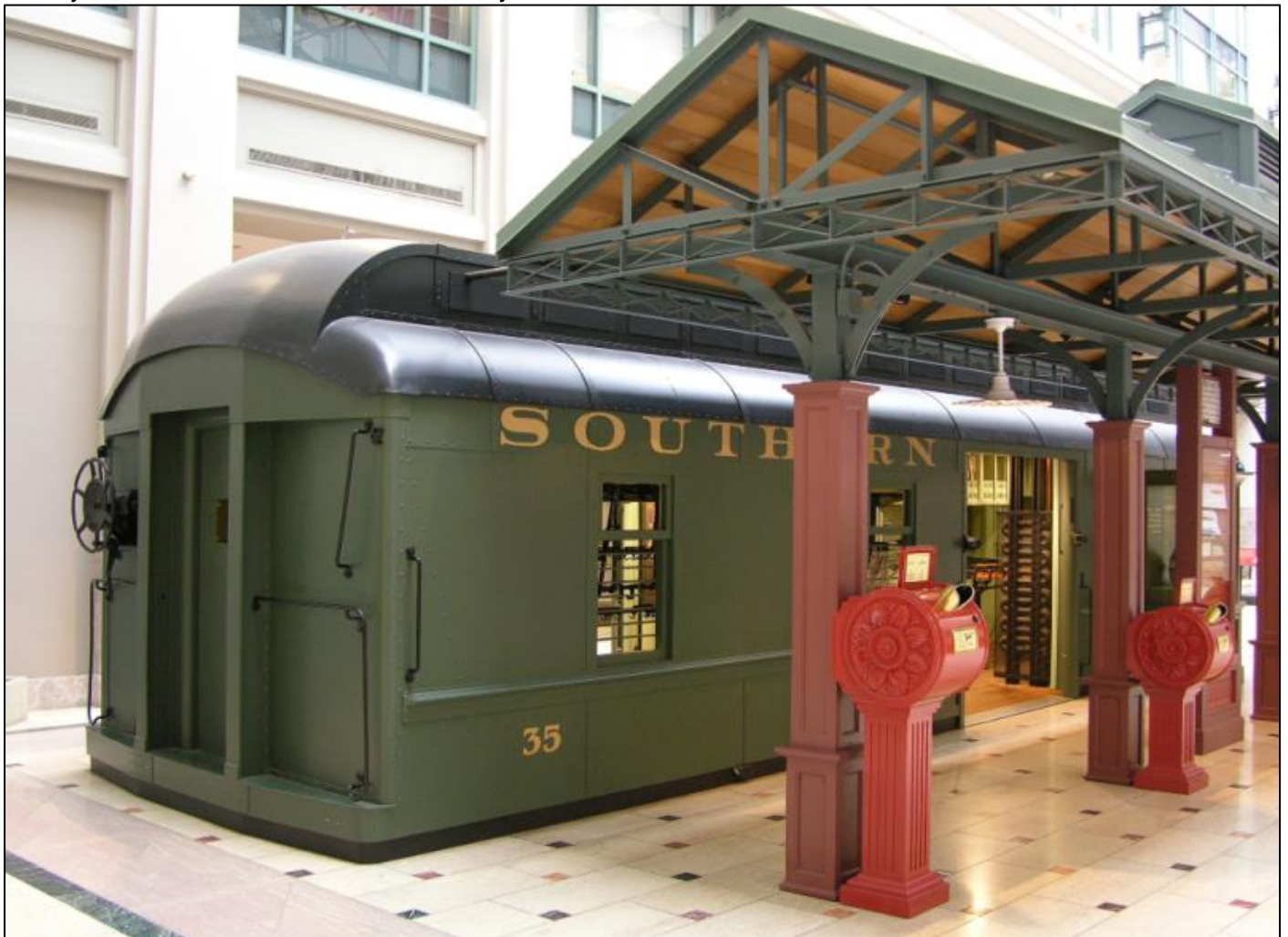
Reproduction of Railway Mail Car.