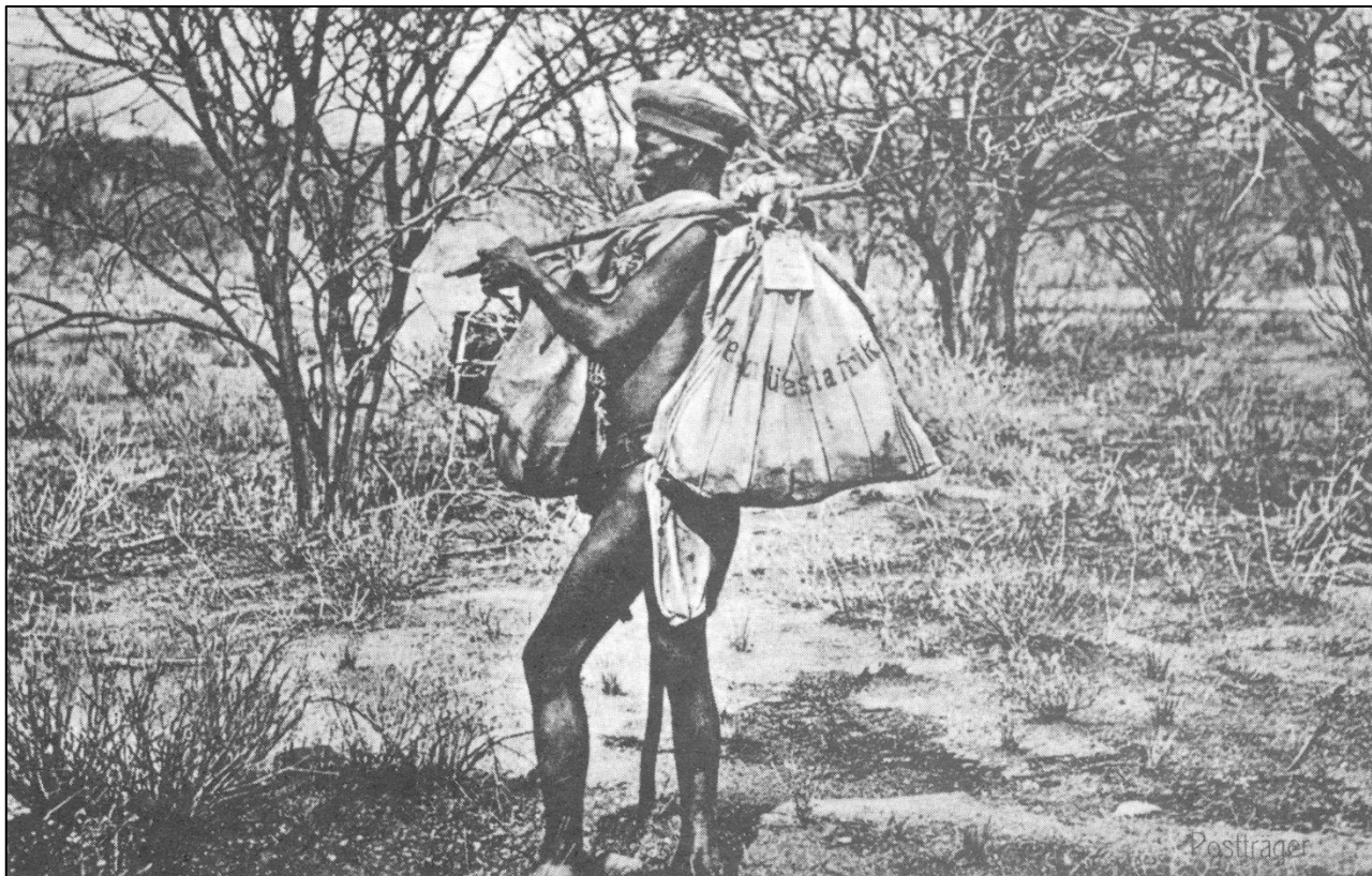
Postal runner on the route Tsumeb – Ondangwa with post bag and pouch of provisions.

the postal runner's mortal remains nor the mail was found. People were also a threat. During the armed conflict between Nama and Herero sealed documents were viewed with suspicion by both warring parties, even though the missionaries did their best to remain neutral and mediate between the two.